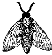
Figure 2: A sample black and white graphic that has been resized with the includegraphics command.

of tables, use the environment figure* to enclose the figure and its caption. And don't forget to end the environment with figure* , not figure !